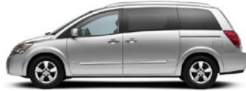
3.5 S: MORE CONVENIENCE