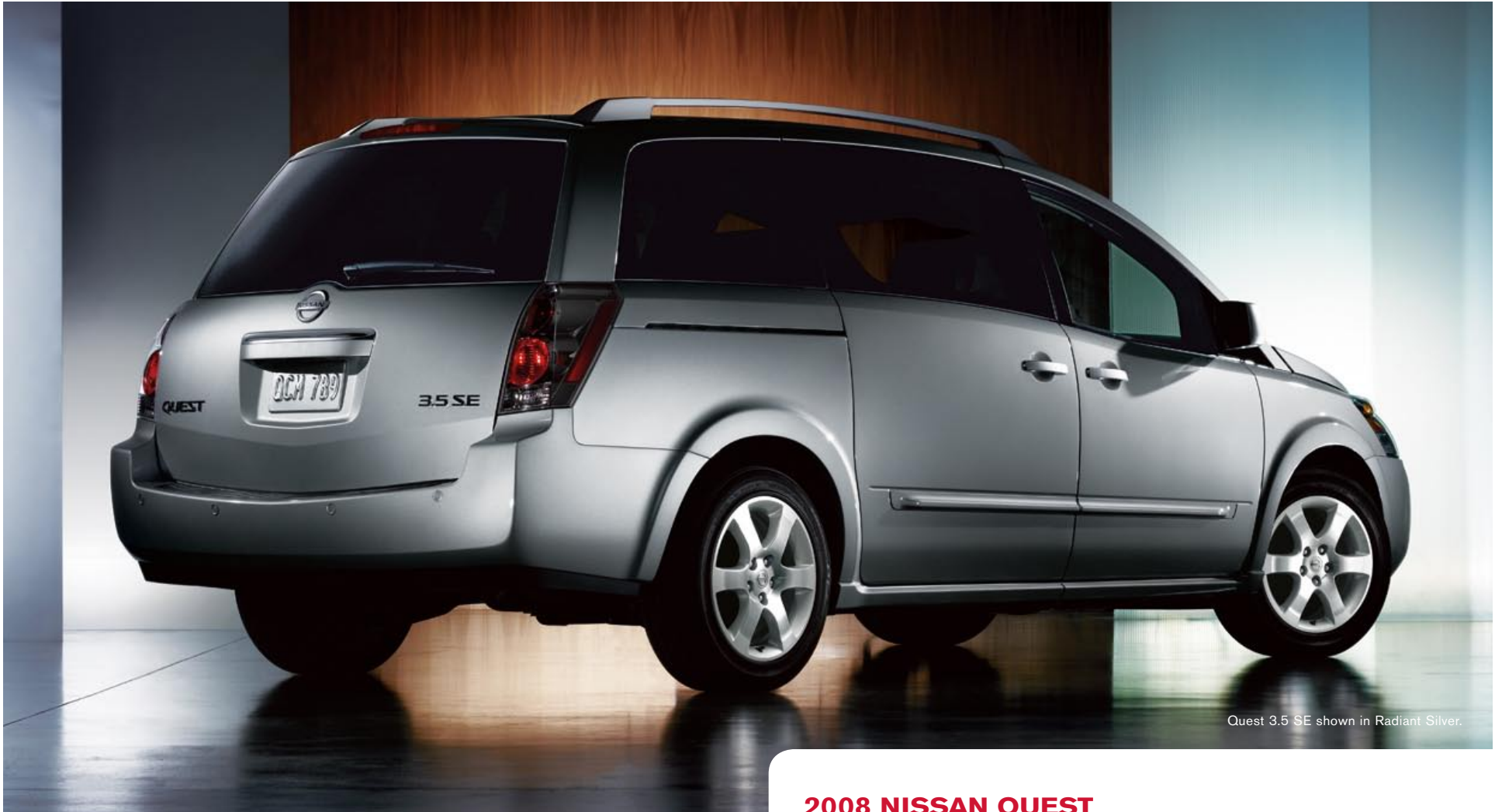
Quest 3.5 SE shown in Radiant Silver.