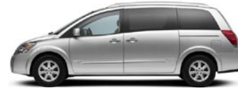
3.5 SL: REWARDS FOR EVERYONE